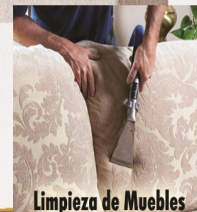
Limpeza de Muebles