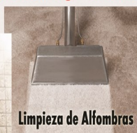
Limpeza de Alfombras